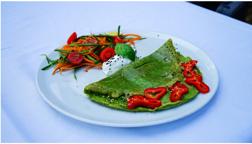
VEGETABLE OMELETTE SERVED WITH YOGHURT AND SALAD