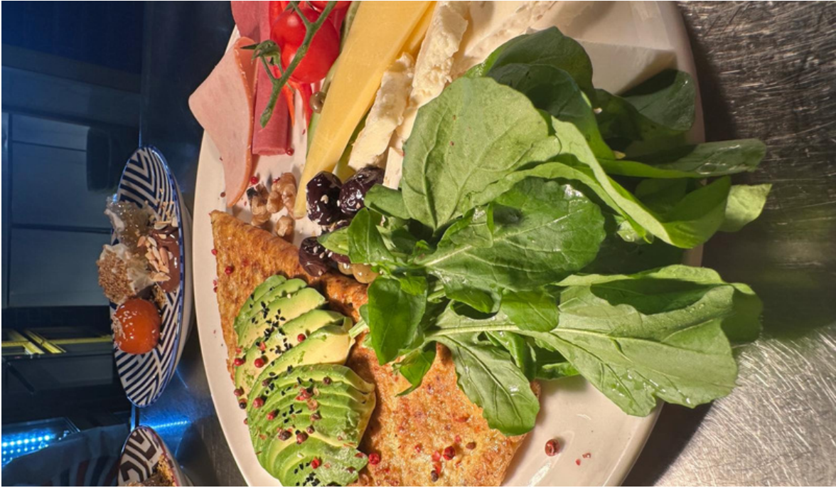
ANJELIQ BREAK PLATE